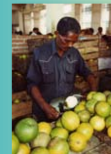
Photograph by Heather Bennett Exhibition: Green Lemons, photographs from Cuba